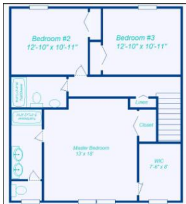
Second Floor Option A